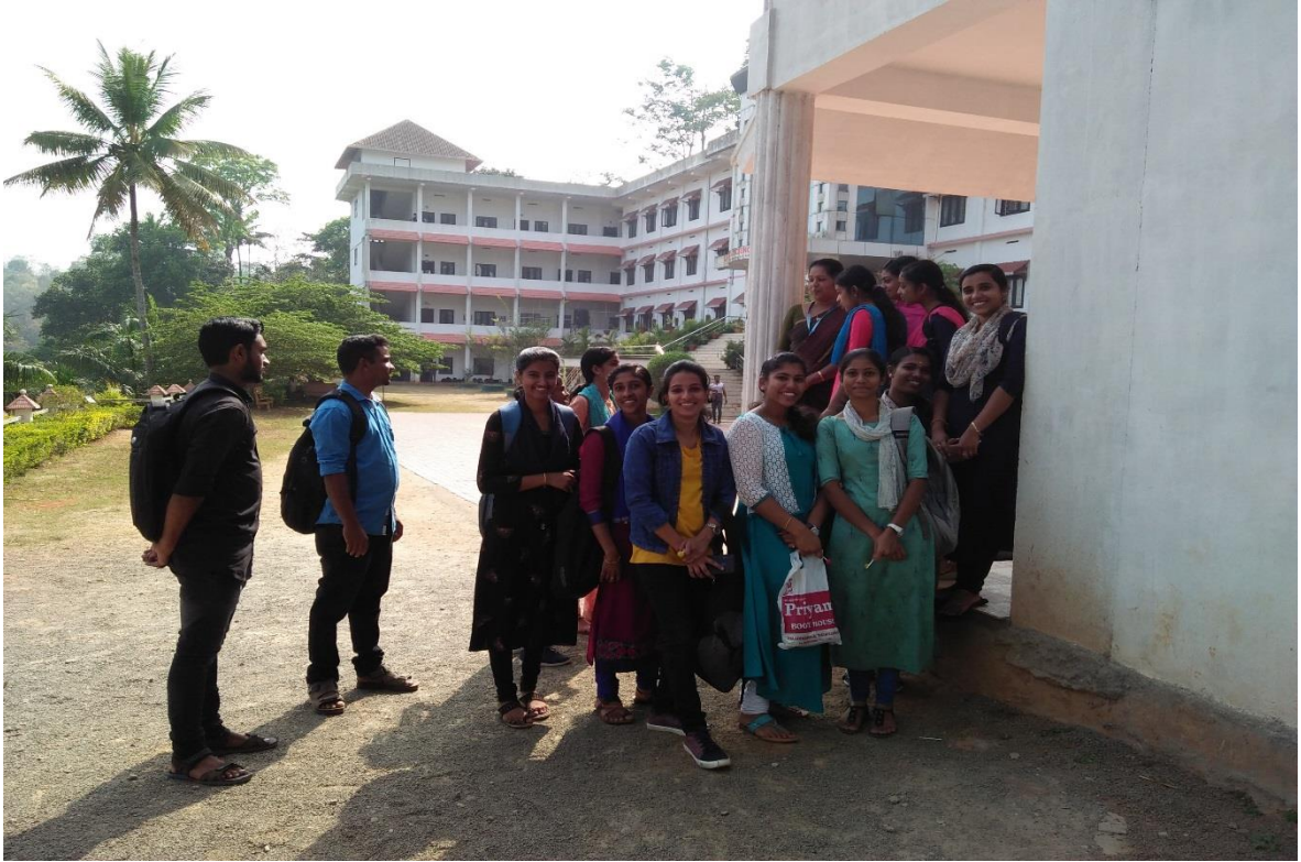
Fig:- Study Tour II MA ECONOMICS