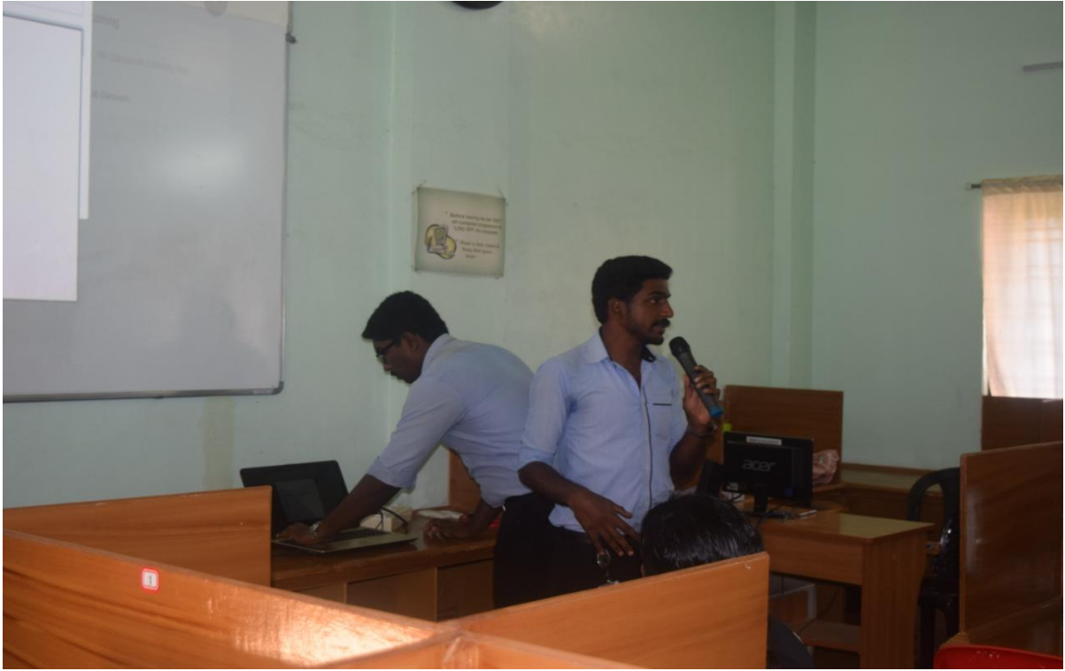
Fig:- EDMODO TRAINING CLASS