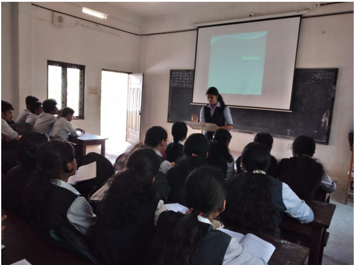
Fig:- Peer Teaching