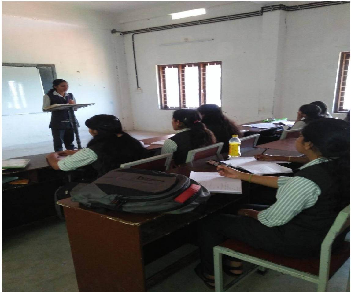
Fig:- Peer Teaching