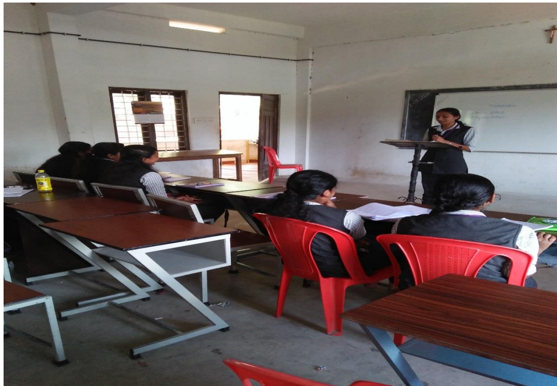
Fig:- Peer Teaching