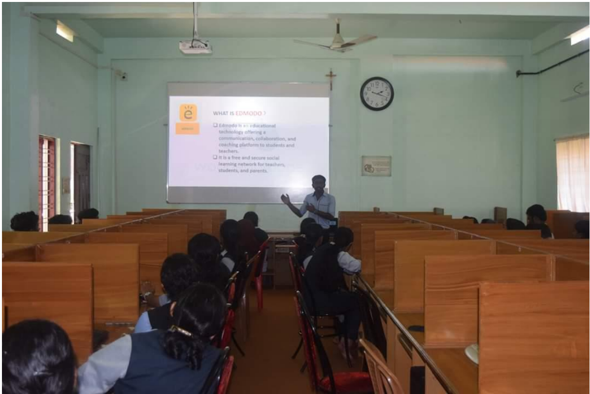
Fig:- Peer Teaching