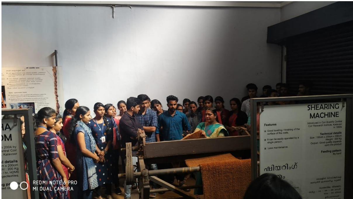
Fig:-2nd year B. Com taxation... industry visit at Alapuzha... international coir fed and museum . 2019-11-22 at 10.33.58 AM