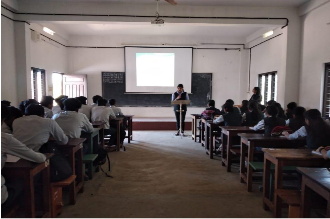
Fig:- Peer Teaching