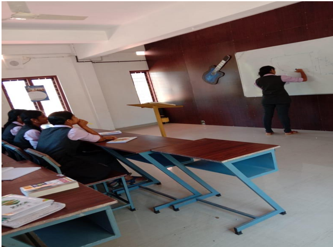
Fig:- Peer Teaching