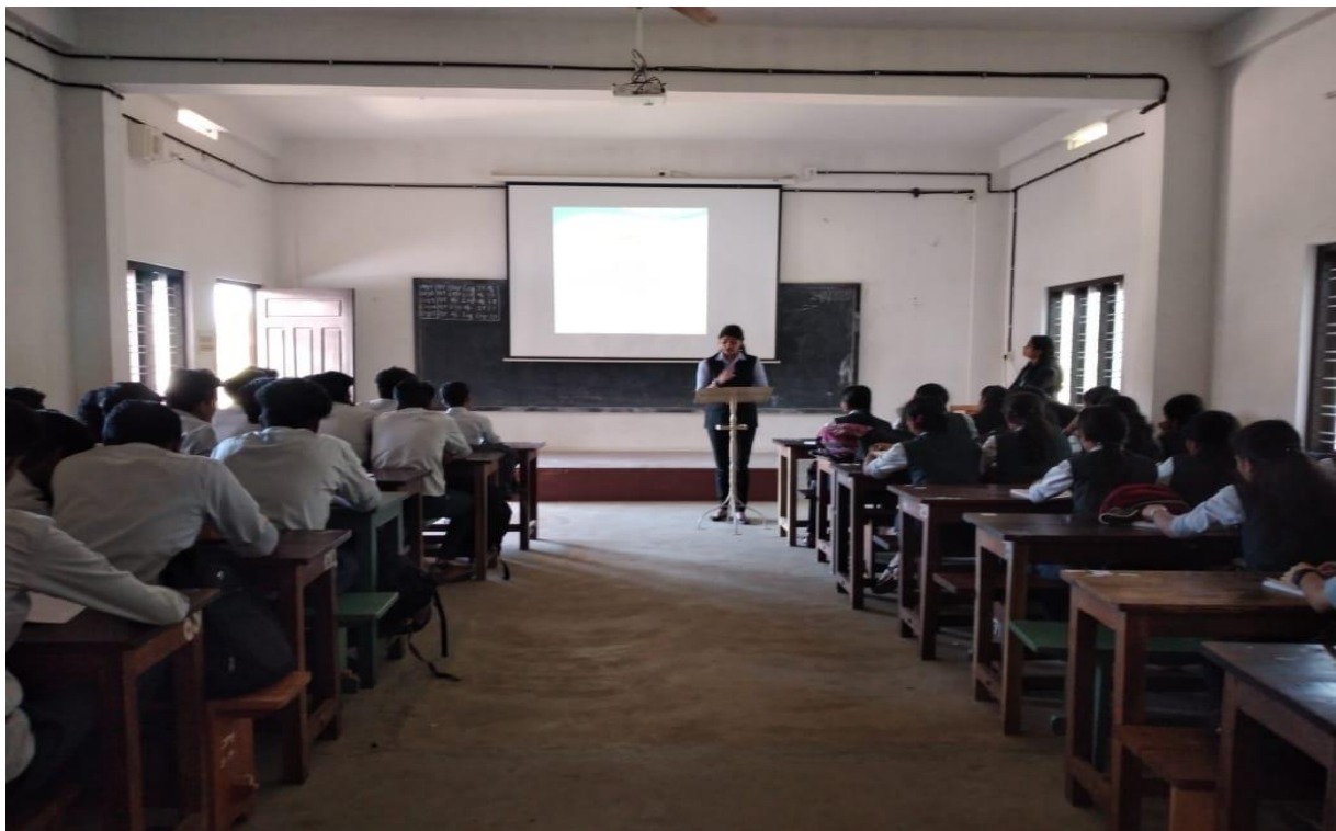
Fig:-Peer teaching ,_session lead by 3rd bba students