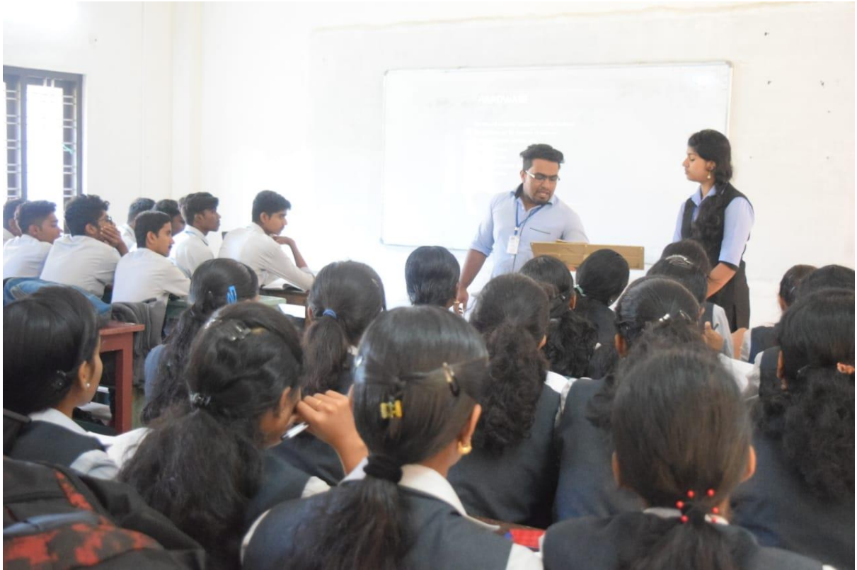
Fig:- Peer Teaching