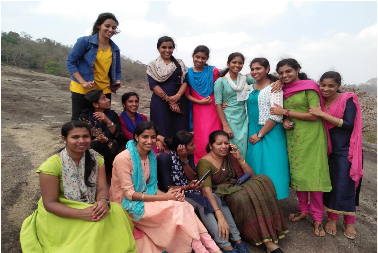
Fig:- Study Tour II MA ECONOMICS