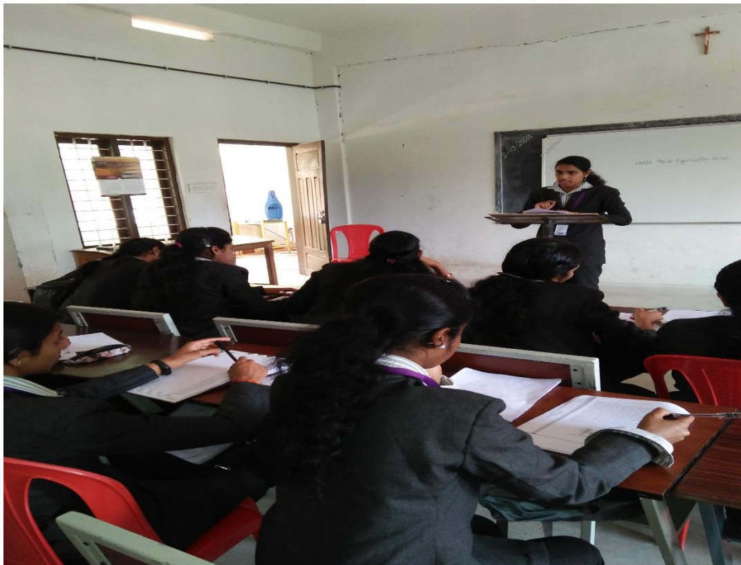
Fig:- Peer Teaching