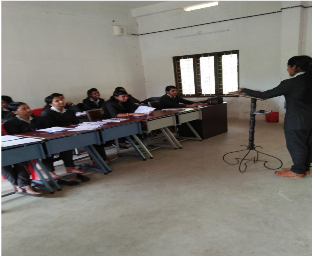
Fig:- Peer Teaching