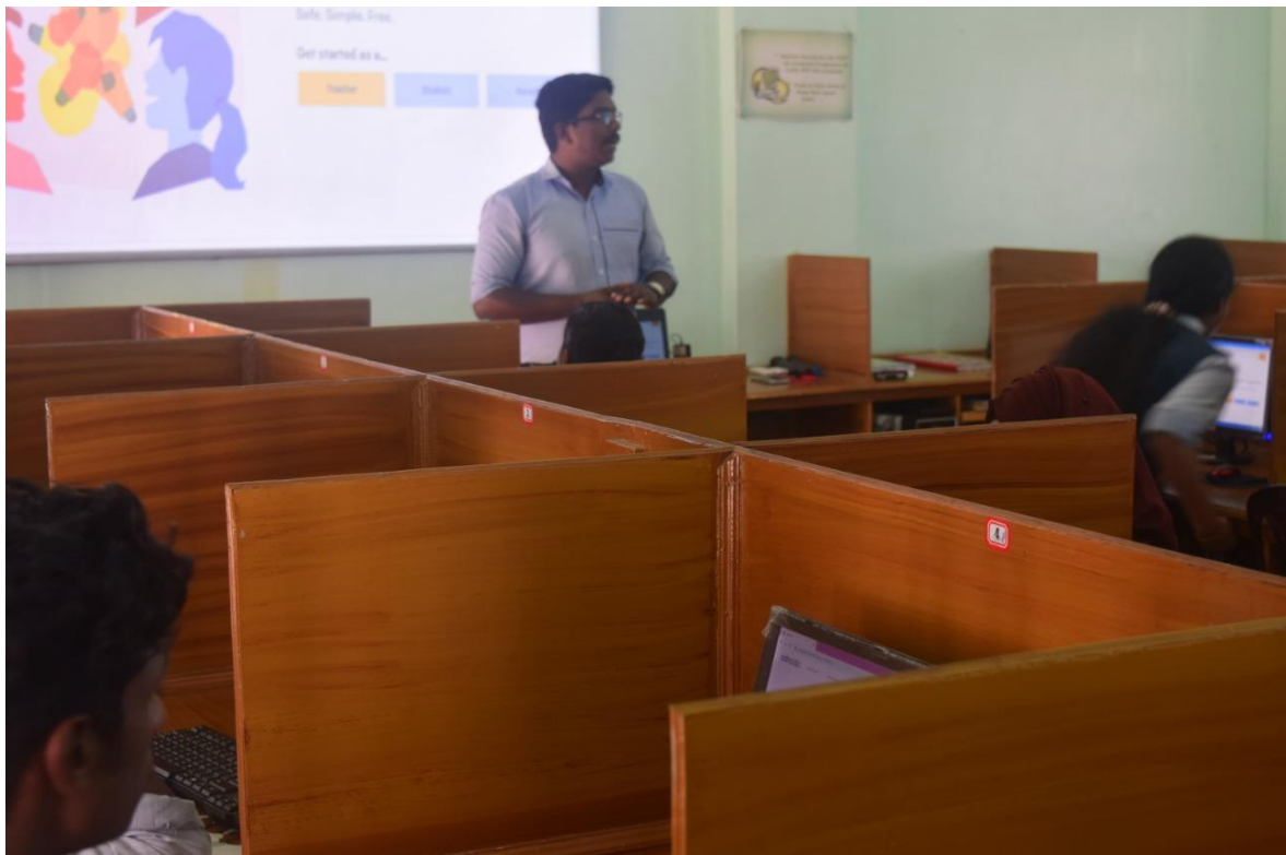
Fig:- Peer Teaching