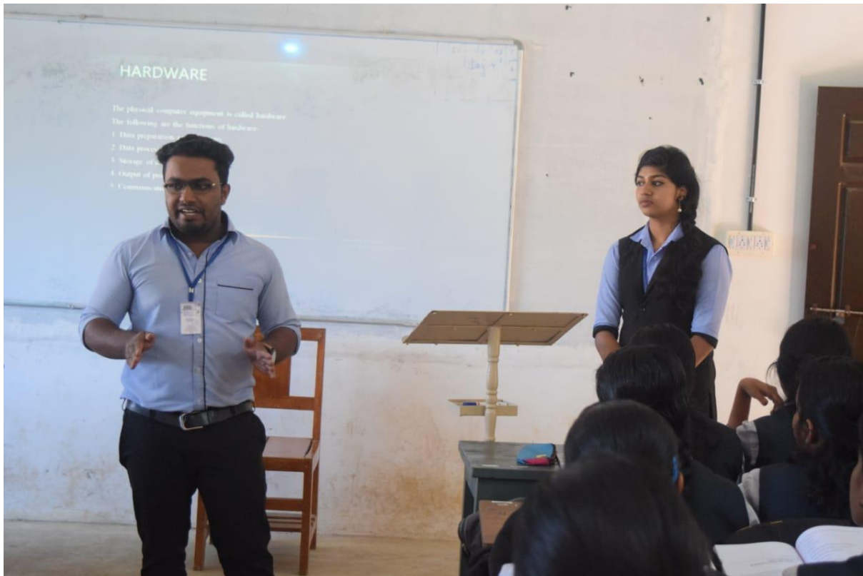
Fig:-Peer teaching ,_session lead by 3rd bba students