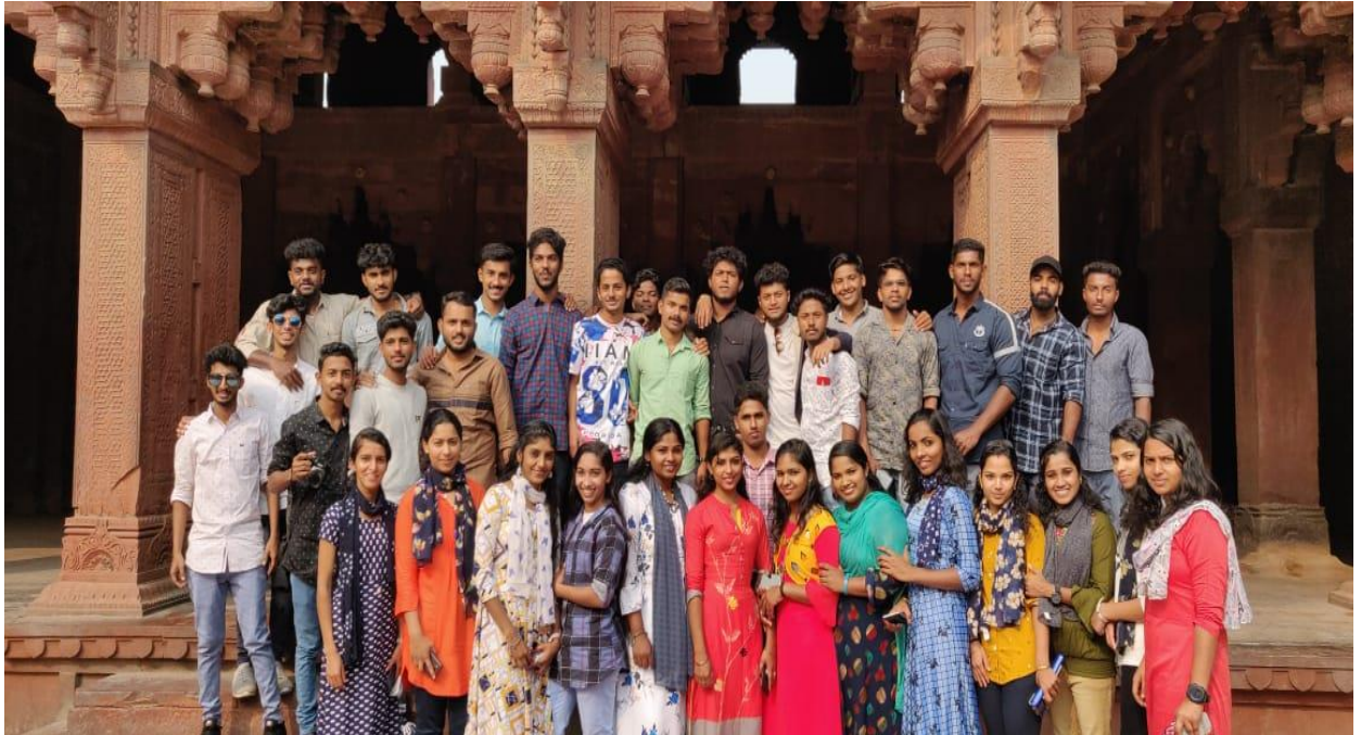
Fig : National Tour BTTM