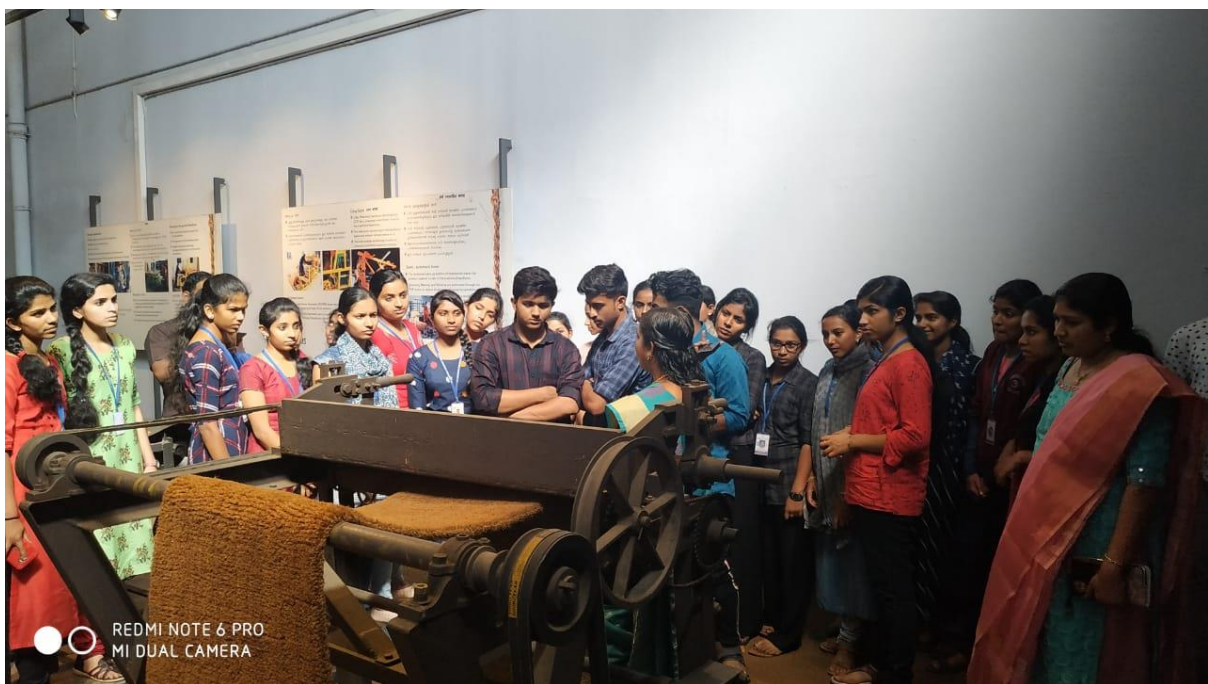
2nd year B. Com taxation... industry visit at Alapuzha... international coir fed and museum. 2019-11-22 at 10.33.58 AM