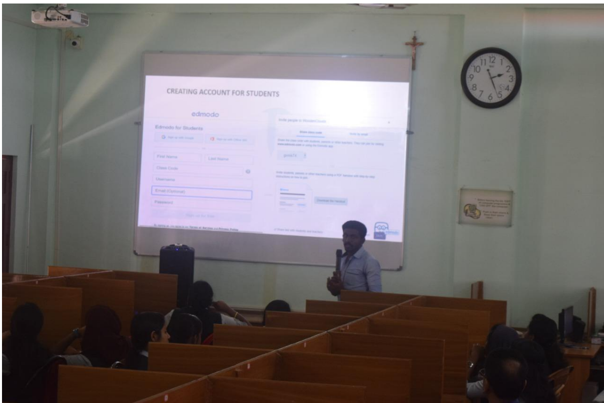
Fig:-Started Edmodo on line learning for JPM students