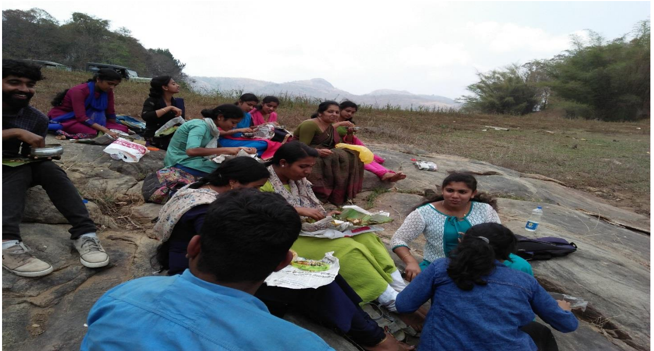
Fig:- Study Tour II MA ECONOMICS